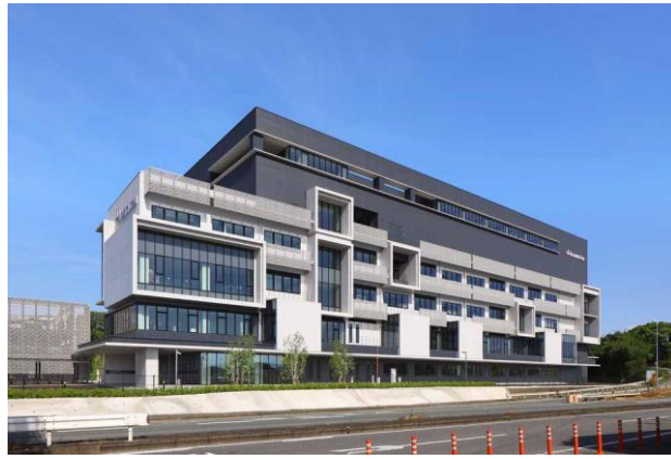
SAGA Global Research Center

We have open innovation spaces, a joint experiment space (open laboratory), and a collaboration office as a place to interact with partners, creating an environment where researchers can work together on innovation. Equipment specific to TDDS drug development, such as skin permeation test equipment, is also available to partners through joint collaboration. Our researchers specializing in TDDS formulations development, will support you in the trial production and evaluation of TDDS formulations.